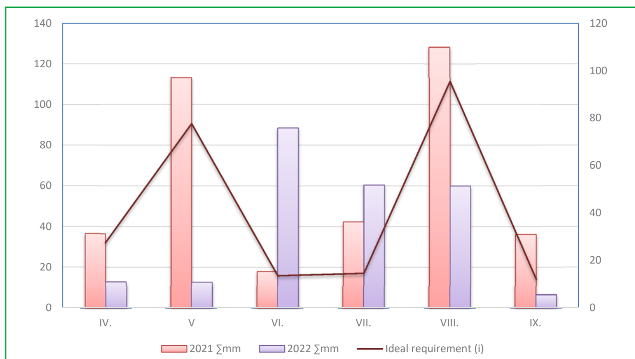
Figure 1 Average monthly precipitation (mm) in 2021 and 2022

Humix Universal® is special liquid foliar and soil fertilizer containing humic substances from Leonardite, macro-elements and micro-elements for the nutrition of field crops (Agrocultúr Bio s.r.o., Nitra, Slovakia). Application to the leaf intensifies plant nutrition, promotes the growth of the root system and the whole plant, resulting in higher and better quality of yields. It contains humic substances minimum 3.0 weight percent (min. 3.0 wt. %)